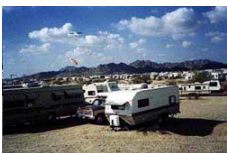
RVers camping at Imperial Dam LTVA

This LTVA is located a distant 22 miles from services in Yuma, but that hasn't kept it down. It's thriving. There is definitely a sense of community here. Volunteers set up organized activities available such as yoga, music performances, race car meets, hiking, aerobics classes, cookouts, model airplane groups and even a lending library dubbed "Liberry".